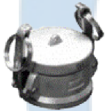
Dust Cap Aluminum Size (in): 2"-12"