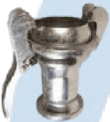
Bauer Increacer Size (in): 4"F x 6"M 6"F x 8"M