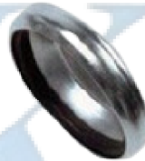
Female Bauer Cap Size (in): 4"-8"