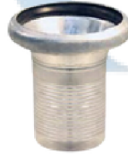
Female Bauer x Shank Size (in): 2"-12"