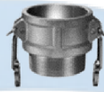
Part B: Female Cam x Male NPT Aluminum Size (in): 2"-12"