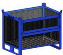
Accessory Cage Size (in): 44 x 48 x 40