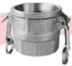
Part D: Female Cam x Female NPT Aluminum Size (in): 2"-12"