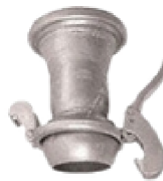
Bauer Reducer Size (in): 6"F x 4"M 8"F x 6"M