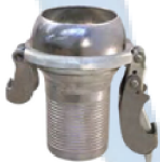
Male Bauer x Shank Size (in): 2"-12"