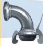
Male x Female Bauer 90° Size (in): 2"-12"