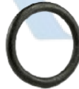
Bauer O-Ring Size (in): 4"-12"