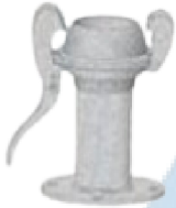
Male Bauer x Flange Size (in): 2"-12"