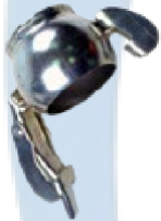
Male Bauer Plug Size (in): 4"-8"