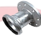
Female Bauer x Flange Size (in): 2"-12"