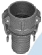
Part C: Female Cam x Hose Barb Aluminum Size (in): 2"-12"