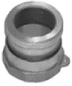
Part A: Male Cam x Female NPT Aluminum Size (in): 2"-12"