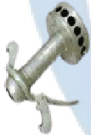
Male Bauer Strainer Size (in): 4"-12"